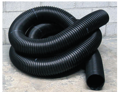
6" Black Knight Hose Recommended length 150'

Price of Bags: Part # IRBD $38.00 Deluxe Bag Part # IRBE $23.50 Economy Bag 6" Black Knight Hose $ 8.60 per foot Sold in 25' or 50' sections